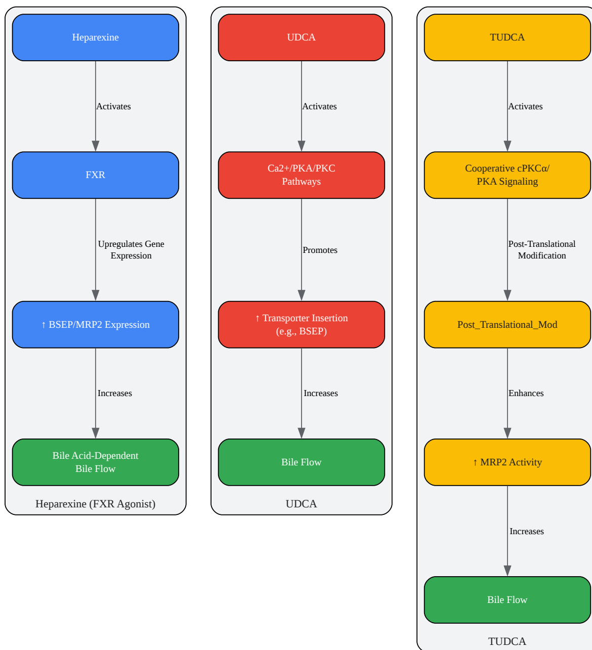
Figure 1: Comparative Signaling Pathways of Choleric Agents

are partly mediated by a cooperative action between cPKC \alpha - and PKA-dependent mechanisms, which enhances the function of canalicular export pumps.[10]