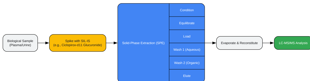
Diagram 2: Recommended Sample Preparation Workflow for Ciclopirox Glucuronide

Click to download full resolution via product page