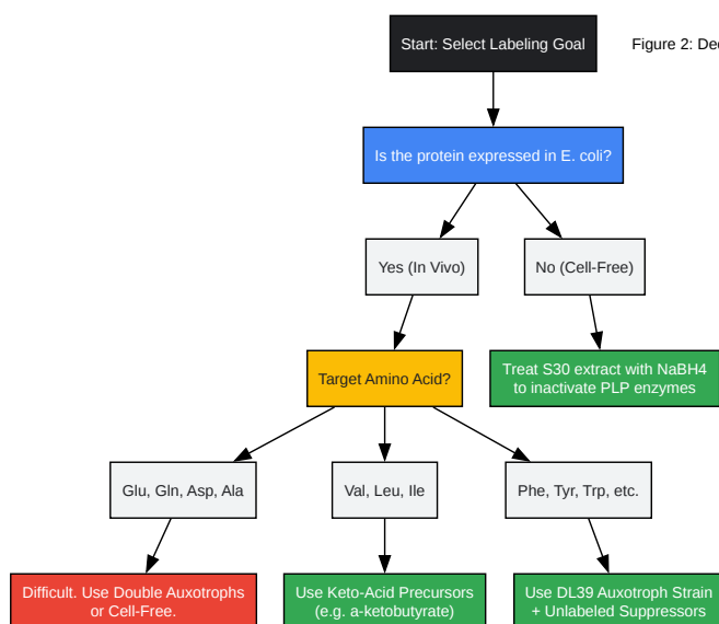
Figure 2: Decision Tree for Minimizing Scrambling based on Expression System and Target Residue.

Click to download full resolution via product page