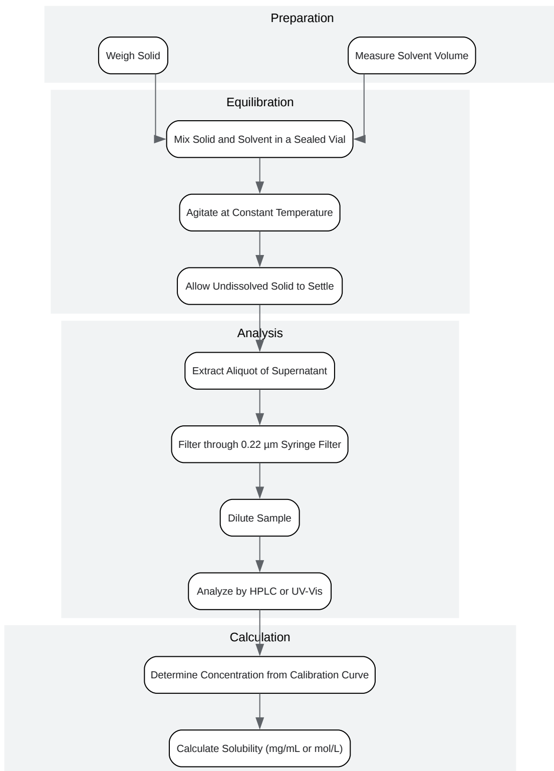
Experimental Workflow for Solubility Determination