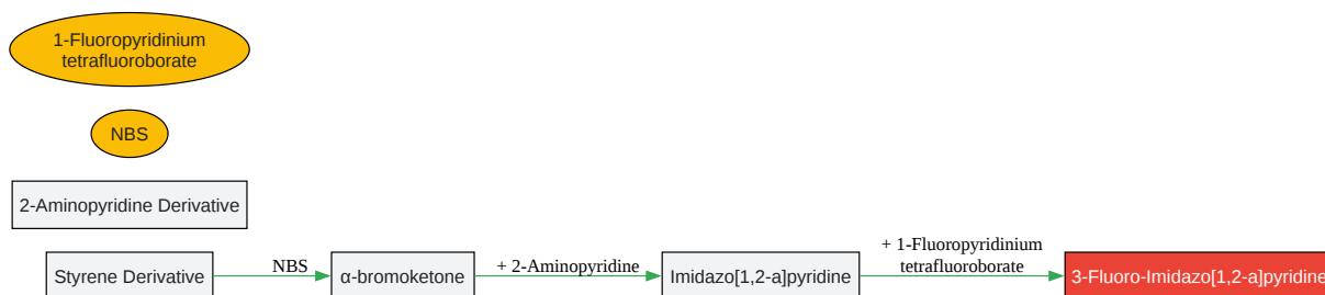
Diagram 1: General Workflow for One-Pot Synthesis of 3-Fluoro-Imidazo[1,2-a]pyridines

Click to download full resolution via product page