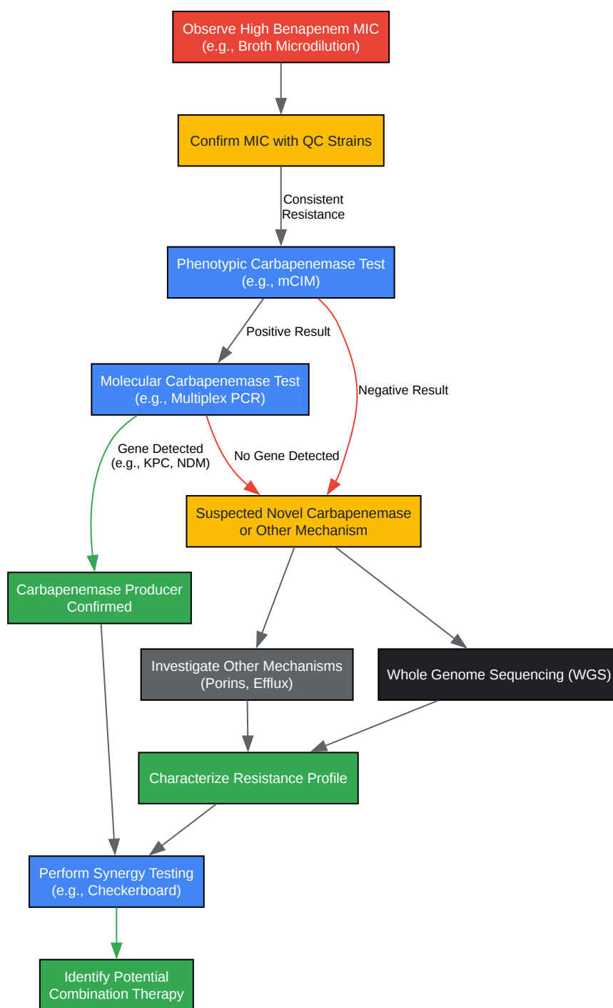
Workflow for Investigating Benapenem Resistance