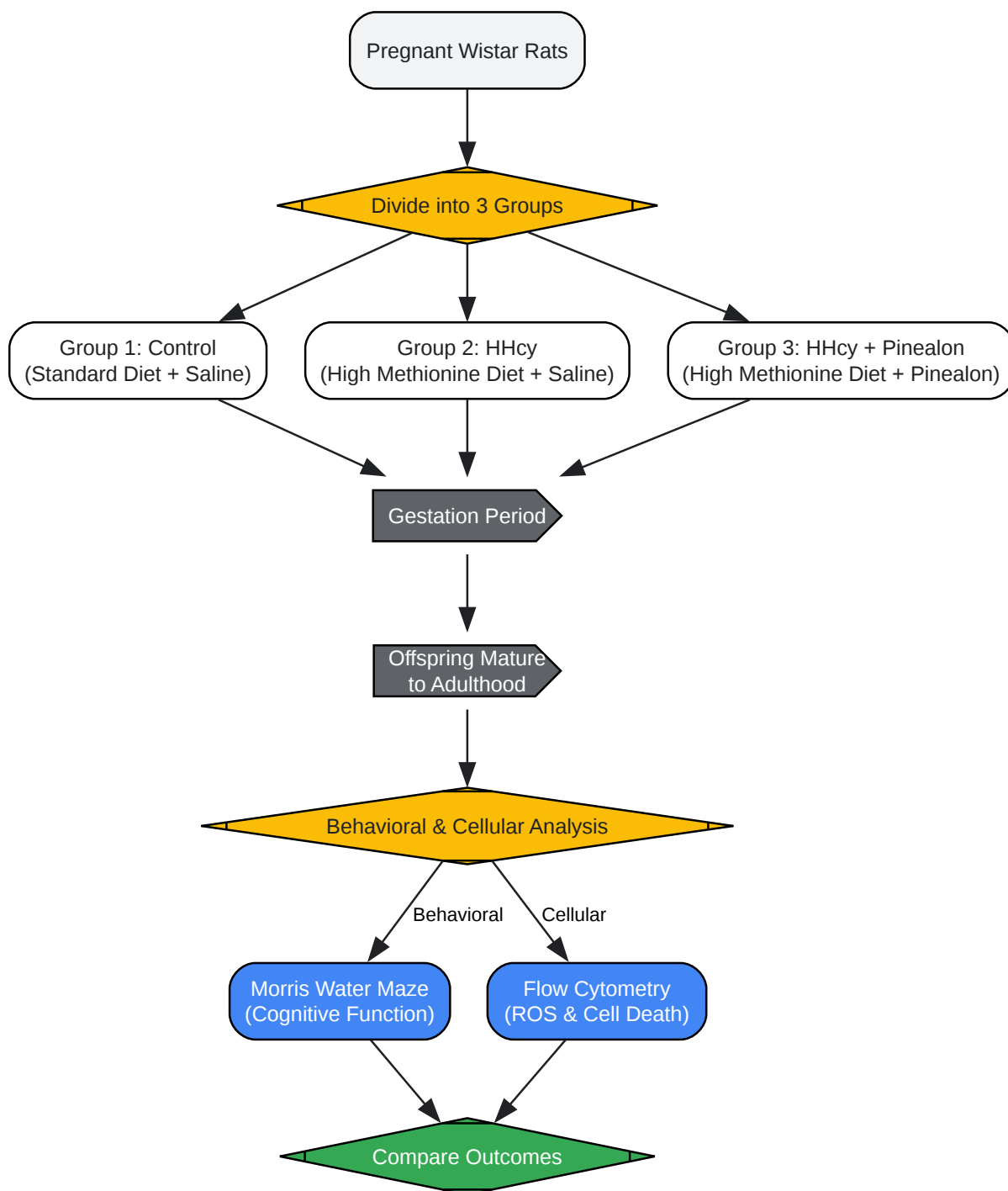
Figure 3: Experimental Workflow for Prenatal Hyperhomocysteinemia Study

Click to download full resolution via product page