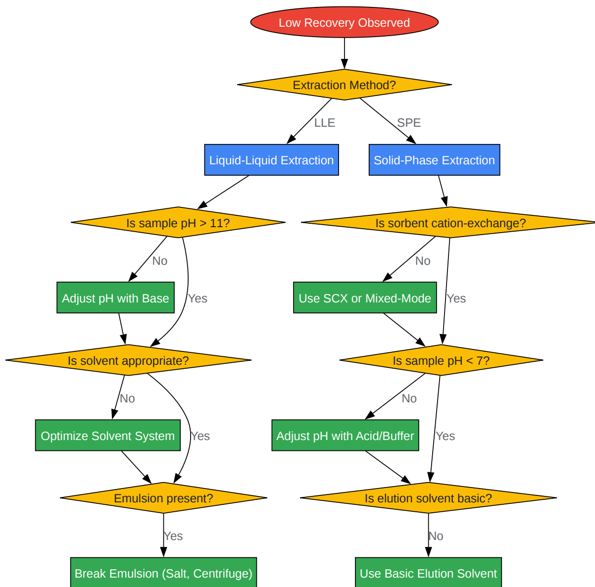
Caption: General Workflow for Solid-Phase Extraction of Biperiden.

Click to download full resolution via product page