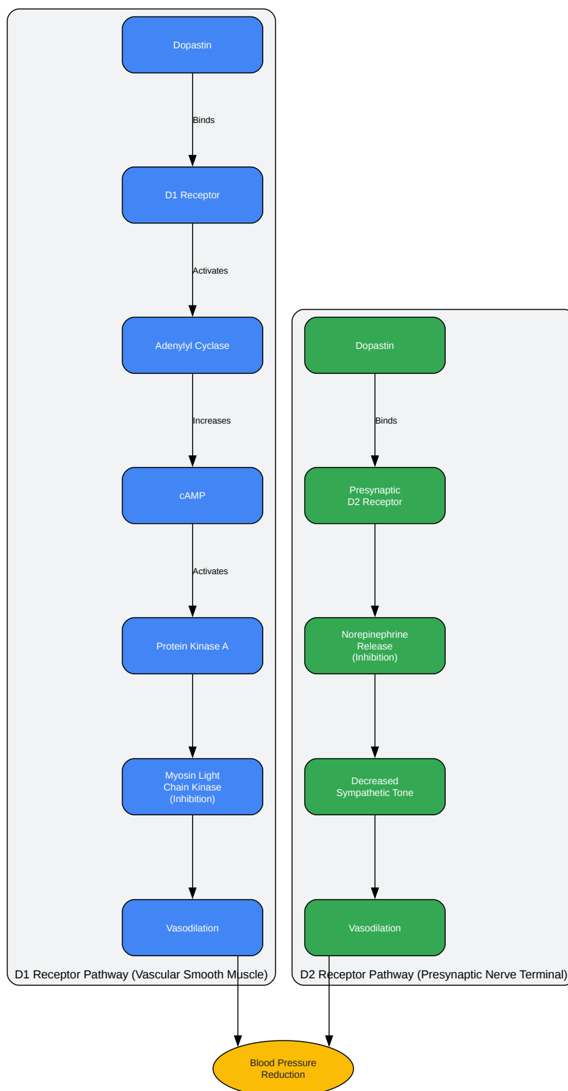
Figure 1: Dopastin Signaling Pathways for Hypotension

Click to download full resolution via product page