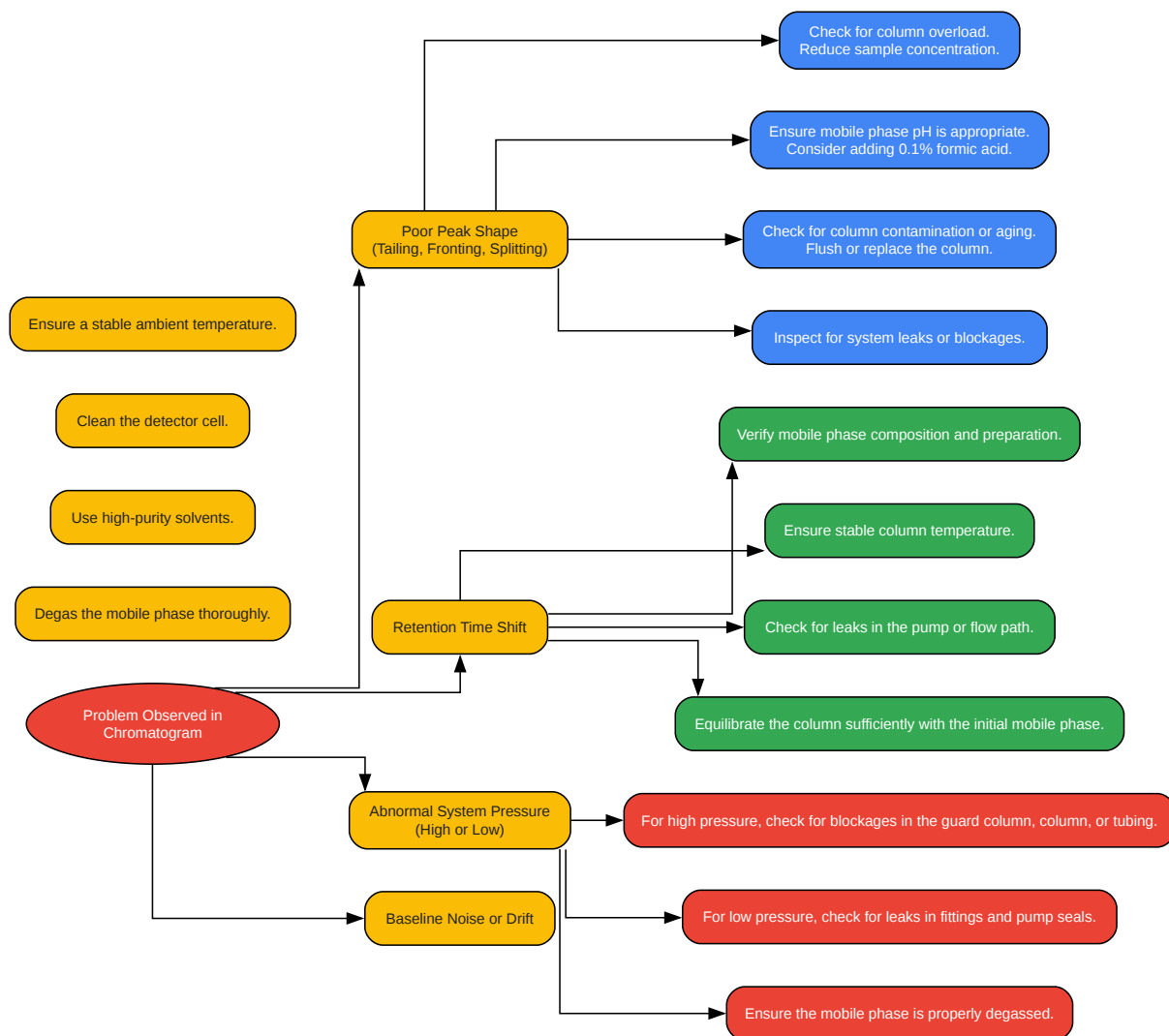
Diagram: HPLC Troubleshooting Workflow

Click to download full resolution via product page