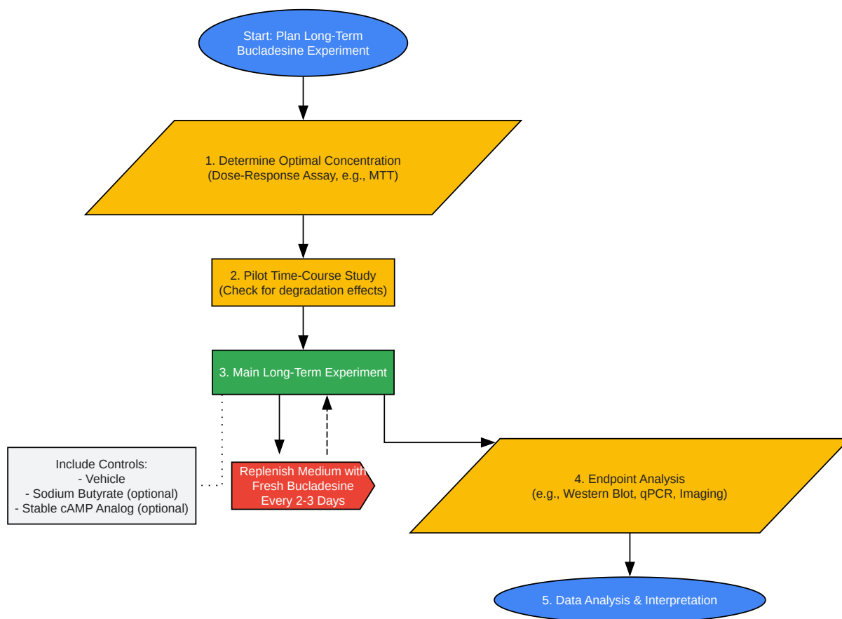
Caption: Bucladesine's dual mechanism of action.

Click to download full resolution via product page