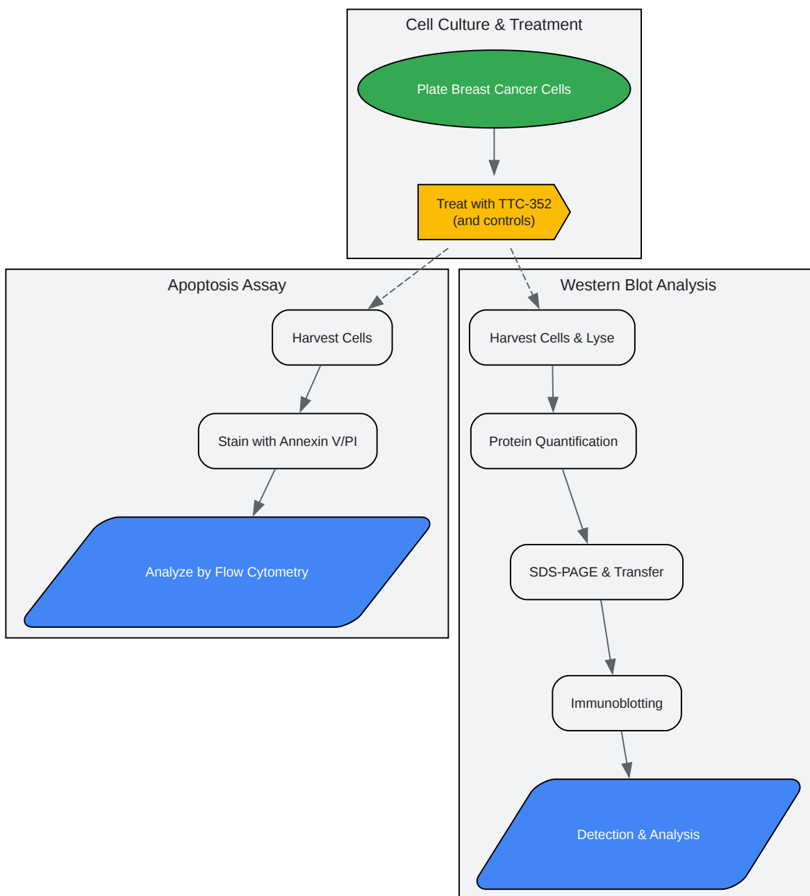
Experimental Workflow for Apoptosis Analysis

Click to download full resolution via product page