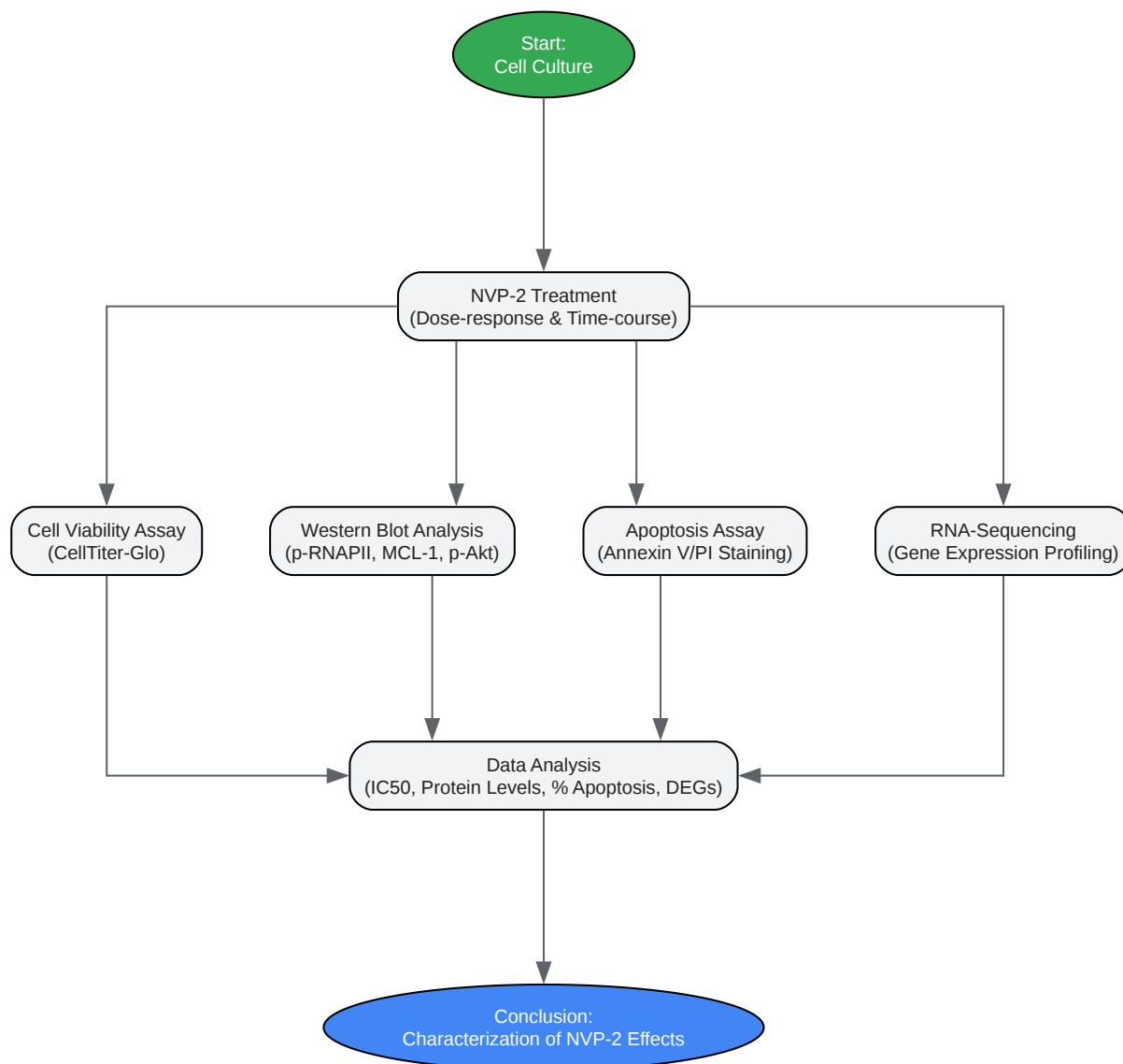
Experimental Workflow for NVP-2 Characterization

Click to download full resolution via product page