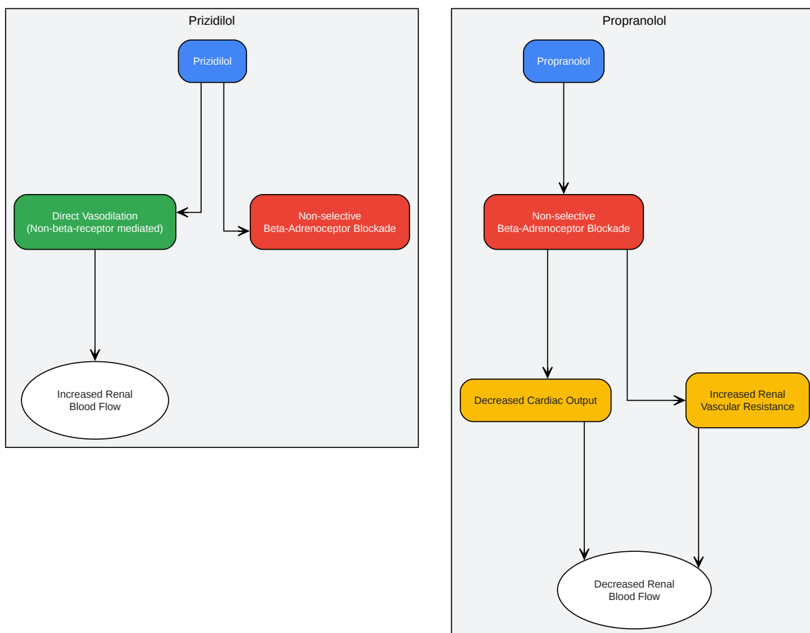
Comparative Signaling Pathways of Prizidilol and Propranolol on Renal Hemodynamics

Click to download full resolution via product page