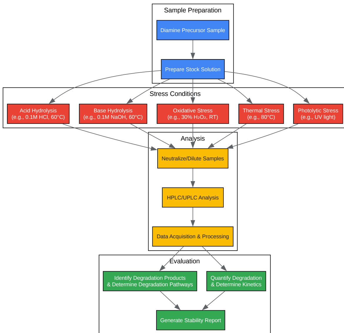
Workflow for Forced Degradation of Diamine Precursors

Click to download full resolution via product page