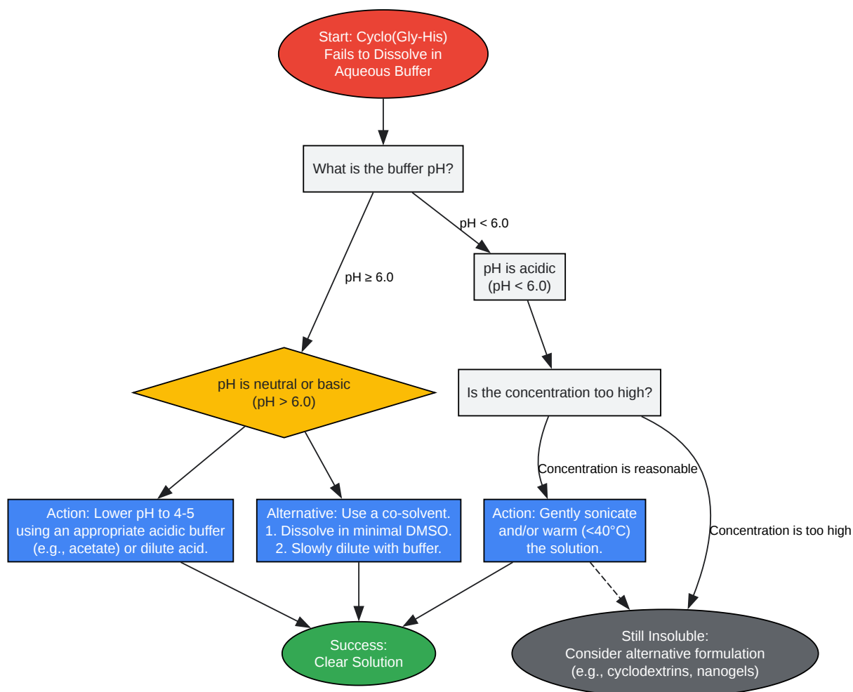
Diagram 2: Troubleshooting Workflow for Poor Solubility

Click to download full resolution via product page