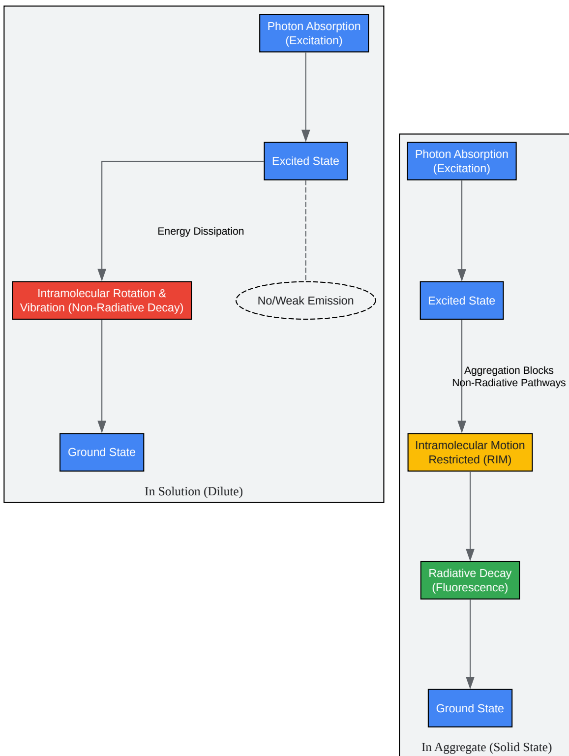
Figure 1: The AIE Mechanism via Restriction of Intramolecular Motion (RIM)

Click to download full resolution via product page