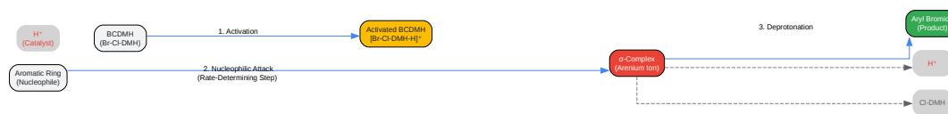
Figure 1: Mechanism of BCDMH Aromatic Bromination

Click to download full resolution via product page