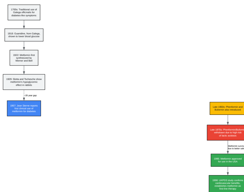
Diagram 1: Historical Development of Biguanides

Click to download full resolution via product page