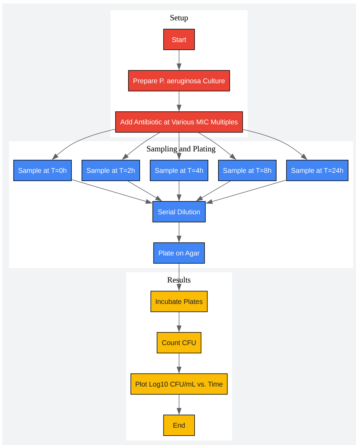
Caption: Workflow for Minimum Inhibitory Concentration (MIC) Testing.

Click to download full resolution via product page